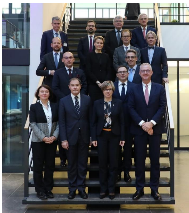
Heads of JHA agencies – meeting at Europol, 22 November 2019

The goal is to pool resources at EU level to create innovative policing solutions for EU law enforcement and JHA actors. This way, instead of investing in 27 different solutions, JHA agencies invest and work together at EU level to create one solution that benefits all JHA actors across the EU. Interagency cooperation here is be crucial.