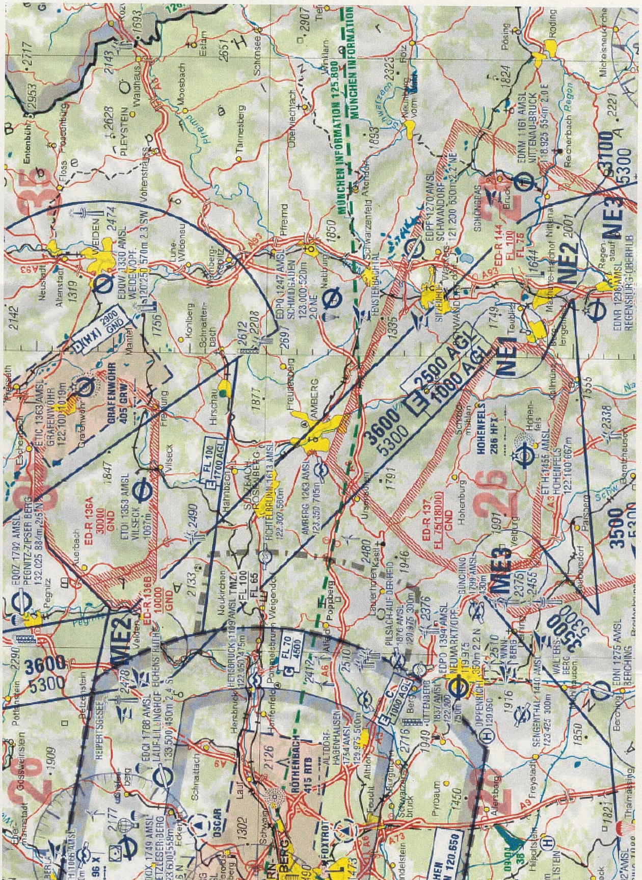
Anlage 1 Karte